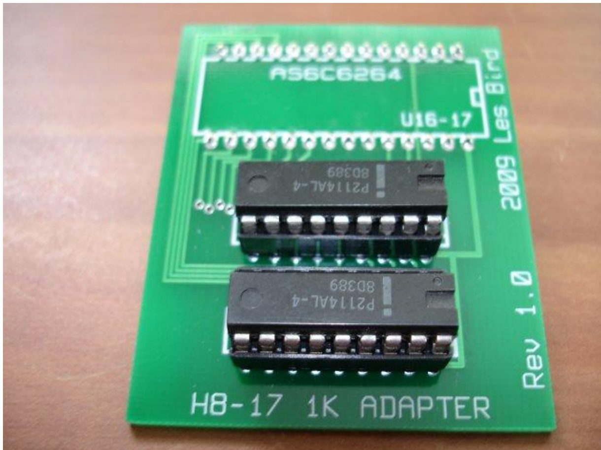
Top photo of the assembled 1K Adapter

If you are installing the H8-17 in an H8 without the extended configuration card you'll need to use the 1K Adapter. This adapter has room for a couple 2114 static RAM chips. The adapter will convert the RAM signals from the AS6C6264 I/O address to those needed for the 2114s.